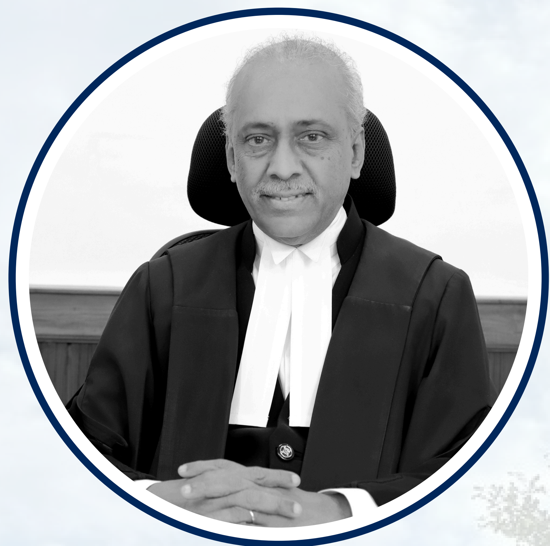
HON'BLE JUSTICE V. RAMASUBRAMANIAN (Retd.) Judge, Supreme Court of India