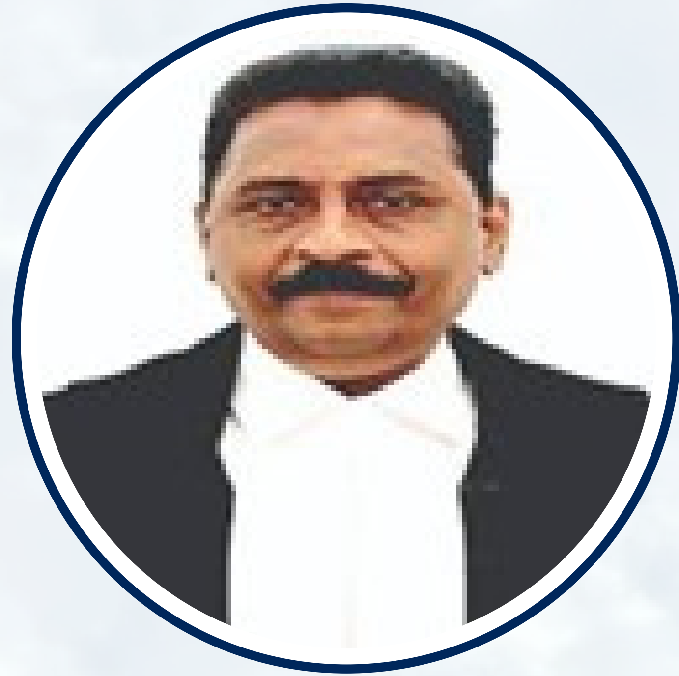
HON'BLE THIRU. JUSTICE M. GOVINDARAJ Former Judge Madras High Court