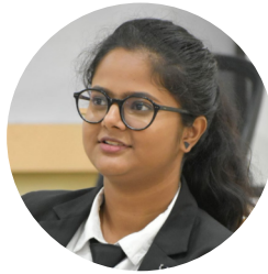
Ahana Raha Core Committee, MCS XLS