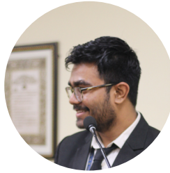
Ashmit Sen Core Committee, MCS XLS