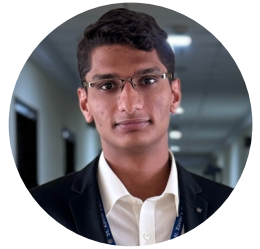
Yazad Motishaw Core Committee, MCS XLS