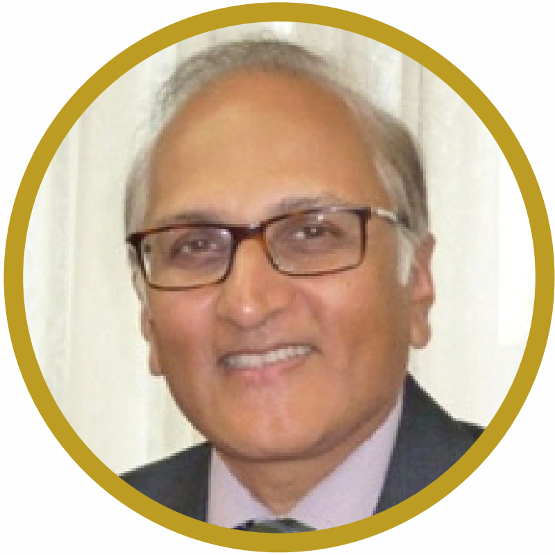
Chief Guest Hon'ble Mr. Justice S. Ravindra Bhat Former Judge, Supreme Court of India