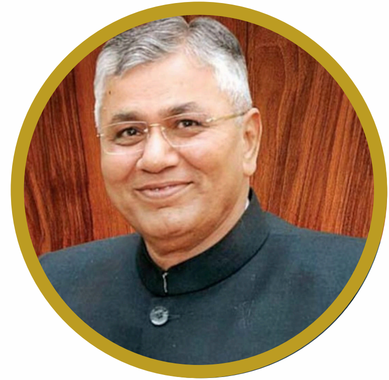
Special Guest of Honour Shri P P Chaudhary Senior Advocate Former Union Minister of State for Law & Justice Government of India