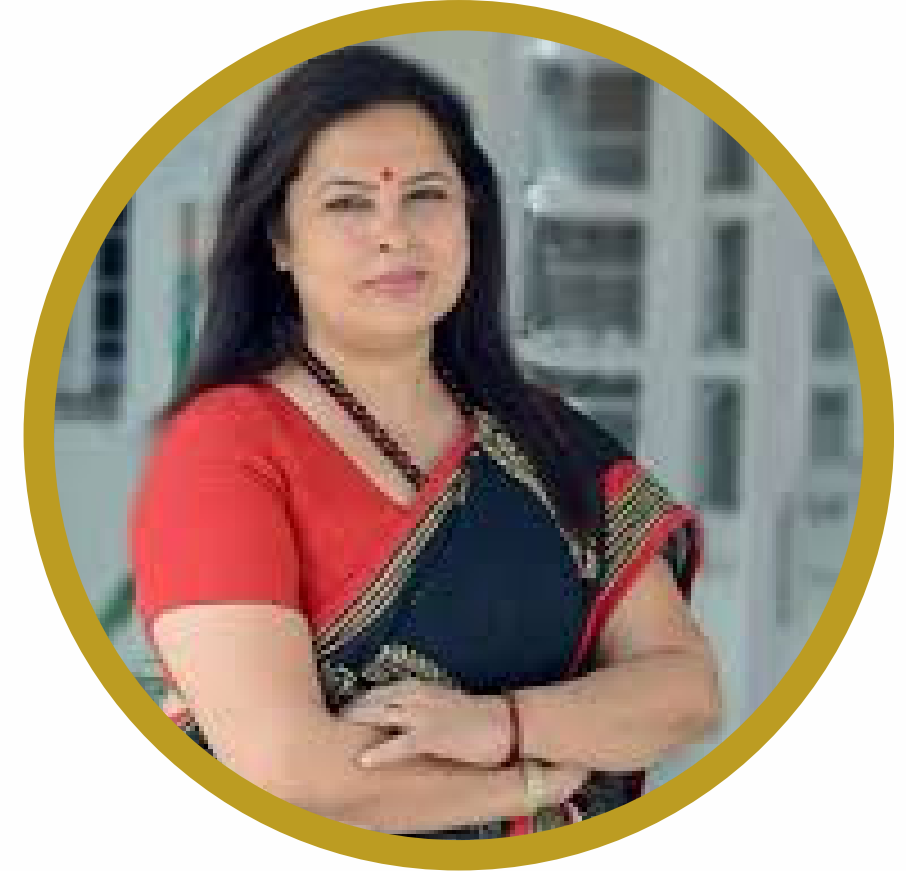
Special Guest of Honour Ms. Meenakshi Lekhi Senior Advocate Former Minister of State for External Affairs Government of India