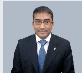
HON'BLE JUSTICE SOMASEKHAR SUNDARESAN Additional Judge, Bombay High Court