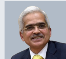
SHAKTIKANTA DAS Governor Reserve Bank of India