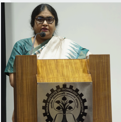
Hon'ble Justice Bandyopadhyay