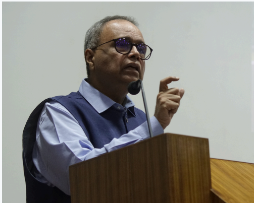
Hon'ble Justice Bagchi