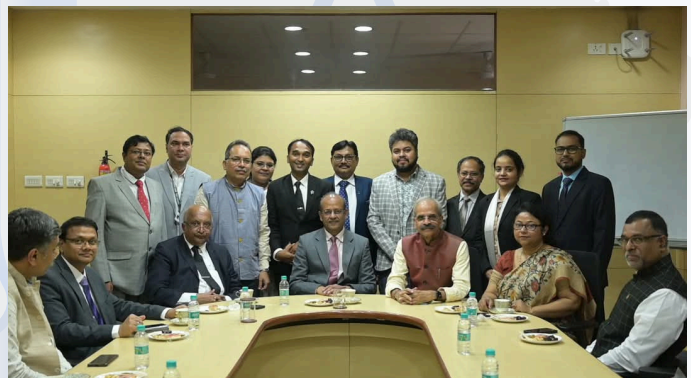
Inauguration by Hon'ble Mr. Justice Rajesh Bindal Judge, Supreme Court of India