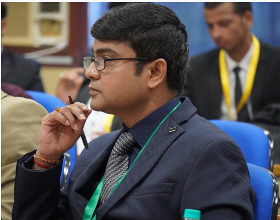
Session Chairs and Participants during Paper Presentation Sessions