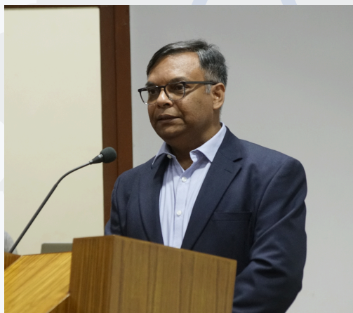
Hon'ble Justice Basak