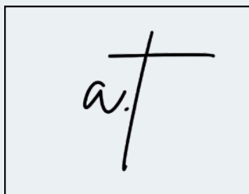
Career & Mentorship Partner