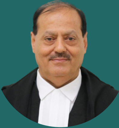
Hon'ble Justice G.R. Moolchandani Acting Chairperson Rajasthan State Human Rights Commission