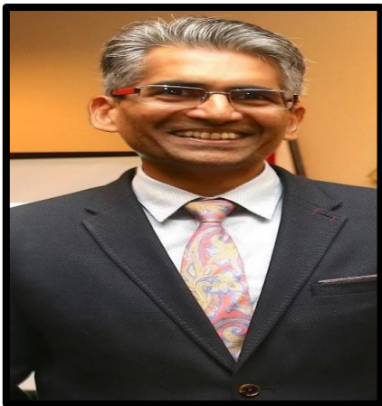
Vasheist Kokaram Judge, Court of Appeal Supreme Court of Trinidad & Tobago